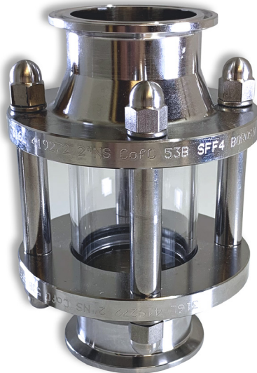
Full view sightglass with clamp connection, item number 1284-